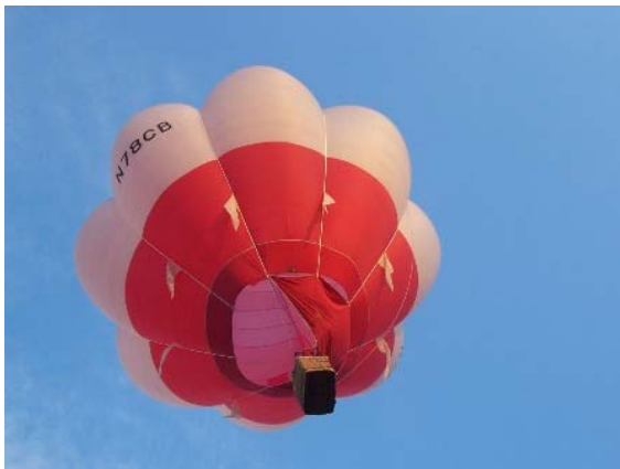
Mike will be looking for volunteers (5 people) to help inflate and launch his balloon.