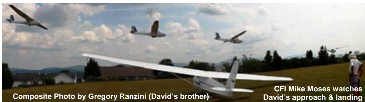
Composite Photo by Gregory Ranzini (David's brother)